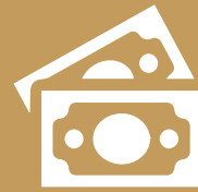
AVG HOUSEHOLD INCOME