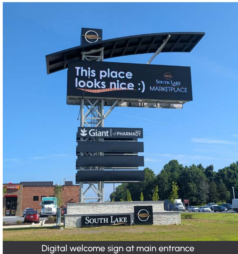
Digital welcome sign at main entrance