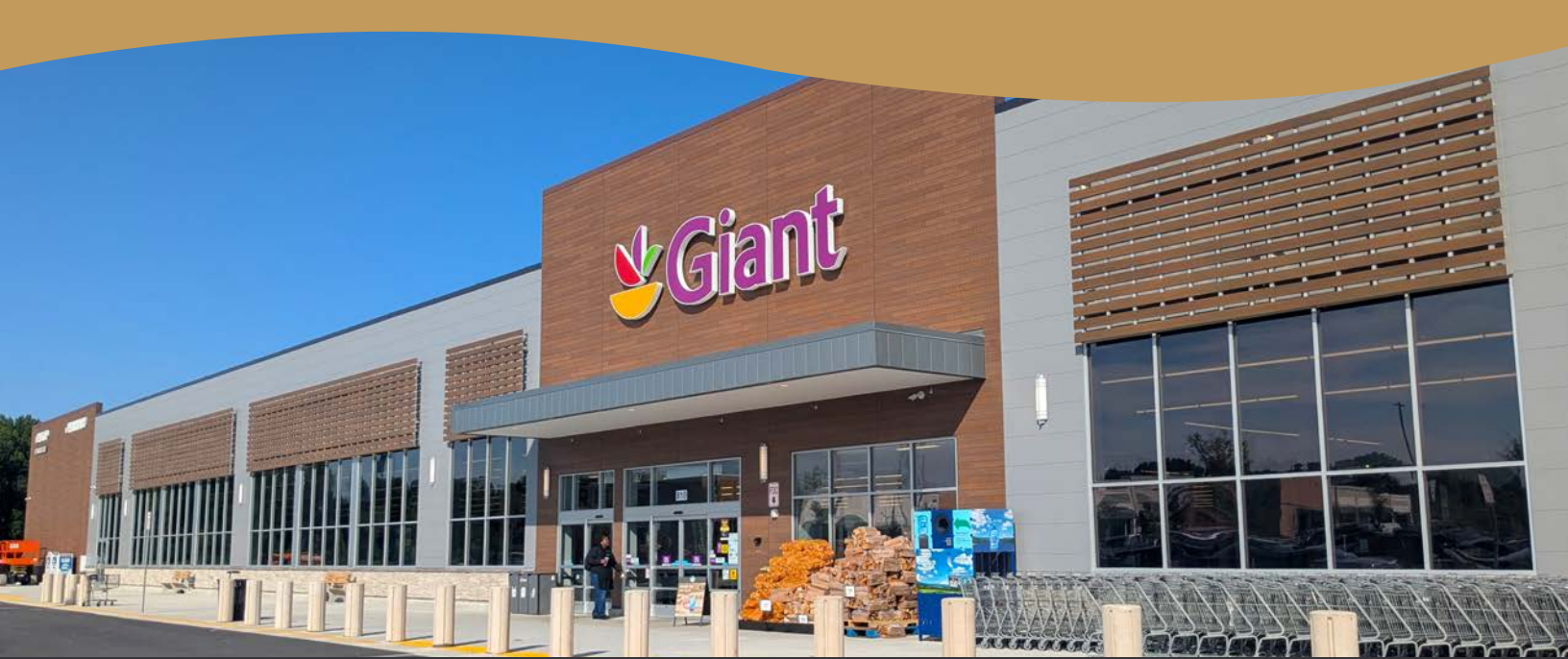
Giant - opened March 2025