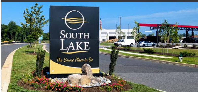
Main entrance, next to Sheetz