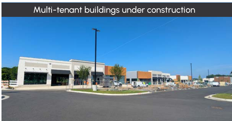
Multi-tenant buildings under construction