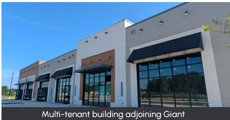
Multi-tenant building adjoining Giant